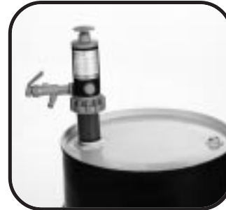
For 30- or 55-gallon containers (113 to 208 liters), Standoff is suggested if spout bumps edge of container. Standoff is available in 3, 4 or 6" lengths (76, 101 or 152 mm).