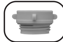
Containers with coarse (Buttress) threads require Buttress Adapter for proper seal: 2.5"-diameter (63-mm) adapter fits most U.S. drums. Use 2.25" (57-mm) adapter for most Asian and 2.75" (70-mm) for most European drums.