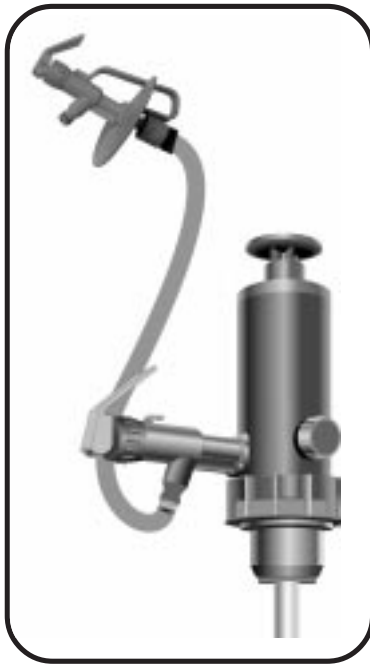
Optional extension tap features nozzle and 5-foot-long hose to transfer solution to a remote container.